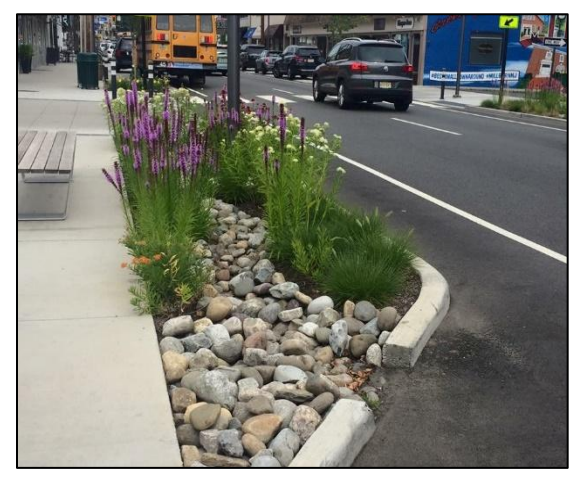
Figure 2. Rain gardens and curb bump-outs are often used together in urban settings. The curb bump-out leaves enough space for a rain garden while also improving pedestrian safety at busy street crossings.