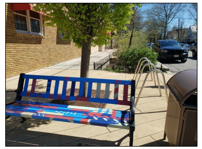
Figure 5. Bench installed as part of the Highland Park streetscape project.

Despite maintenance challenges, the rain gardens are operating as intended. Overall, Highland Park is pleased with the rain gardens and is considering future green streets projects. The borough is interested in using green infrastructure for all development and is considering developing a policy that encourages developers and borough staff to use green streets designs during the planning and design phase of development projects.