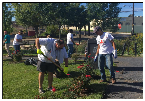
Figure 8. Trainees and volunteers during installation of Waterfront South rain gardens.

Community volunteers helped install the Waterfront South rain gardens. Camden County MUA and its partners conducted a two-day training workshop on rain gardens for landscape professionals and Camden City residents. The training included classroom instruction and field training (Figure 8), during which participants helped install inlets and outlets, spread mulch, and plant the gardens.