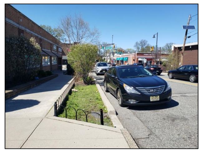
Figure 4. Rain garden with curb bump-out installed as part of Highland Park streetscape improvements.

The New Jersey Department of Transportation, which has jurisdiction over Raritan Avenue, provided a significant amount of funding for the streetscape improvements. In addition, Main Street Highland Park helped the borough obtain a Downtown Business Improvement Zone Ioan from the state's Department of Community Affairs as well