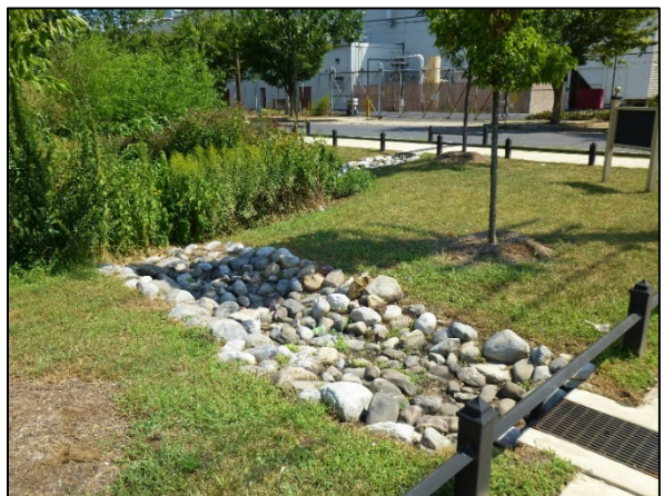
Figure 6. Riprap-lined inlet channel to a bioretention area in the Waterfront South rain gardens.