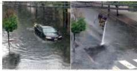
Left: Street flooding in Hoboken on June 1, 2015. Right: workers washing sewage residue off the same street after the flood.

Photographs here can be used or can be replaced with local pictures. Make sure to revise the credit line if you change photos.