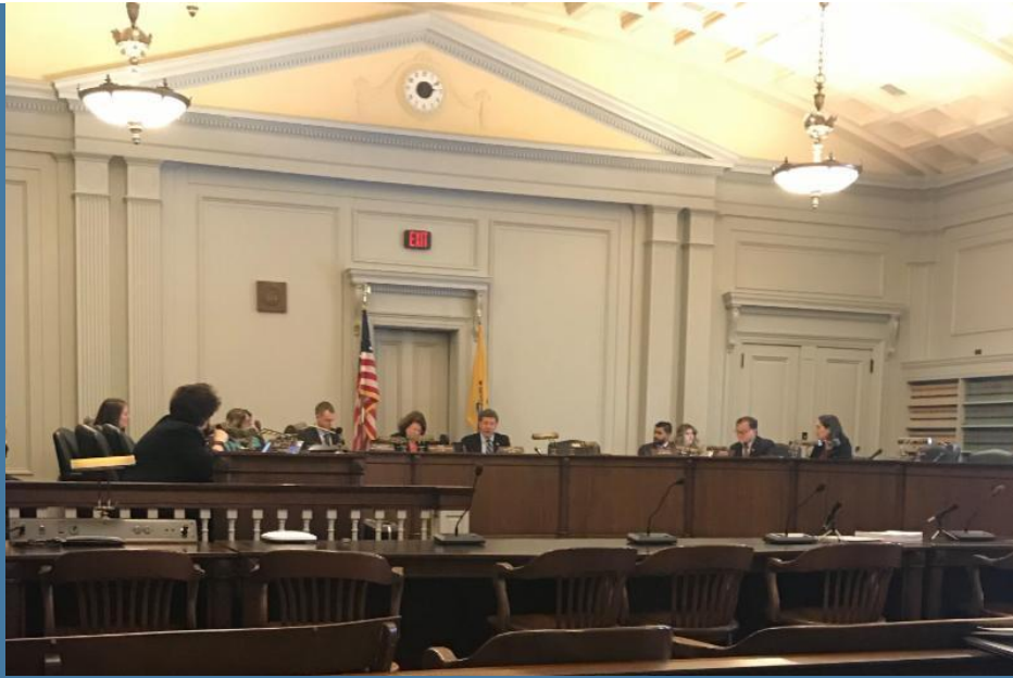
Photo: The Joint Legislative Task Force on Drinking Water Infrastructure convened on Jan. 8 and voted unanimously to adopt the findings and recommendations in its report. Final report here.